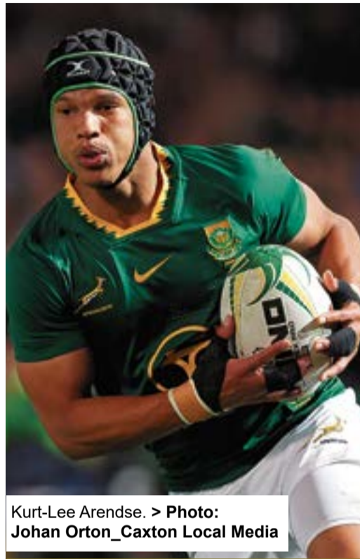
Kurt-Lee Arendse.

ninth Springbok to earn 100 test caps. • The total test caps for the Springbok starting line-up is 484. • There are 165 caps in the backline, with 319 caps amongst the forwards. On the bench, there are a further 437 caps. • The average caps per player in the backline are 24, the forwards 40, while the players on the bench average 55. • Marnus van der Merwe is the first former Laerskool Laeveld learner to play for the Springboks, and the fifth from Hoërskool Nelspruit to play for the 15-man national team.