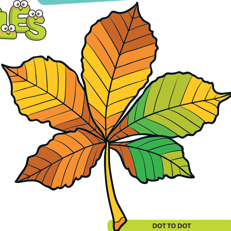
DOT TO DOT