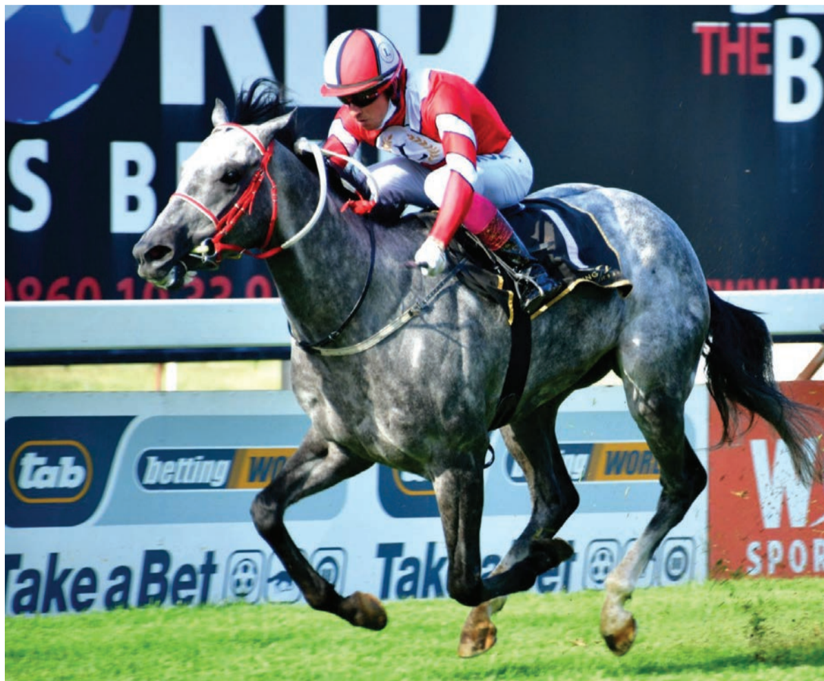
STRONG CHANCE. Willow Express is Muzi Yeni's first choice to win today's World Sports Betting Grand Heritage (Non-Black Type) over 1475m at the Vaal.

All racing results are now carried in the sports pages of The Citizen .