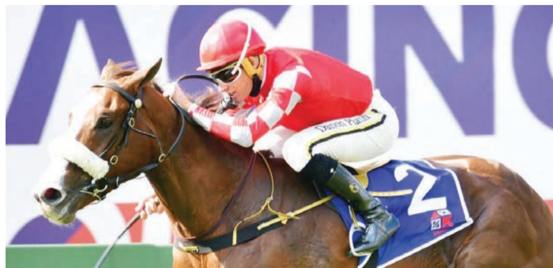
STRONG CANDIDATE. Flying Bull has finished runner-up in his last three starts and is overdue a victory in Race 4 at the Vaal today.

the start when third behind Dancing Arabian, but the winner has gone on to win twice more from four starts.