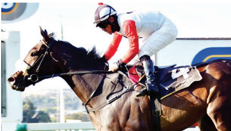
BEST WEIGHTED. Puerto Manzano is strongly expected to get back on the winning trail when he runs in Race 5 at Greyville tomorrow.

He comes into this event as the best-weighted runner by at least 6.5kg and should take a power of