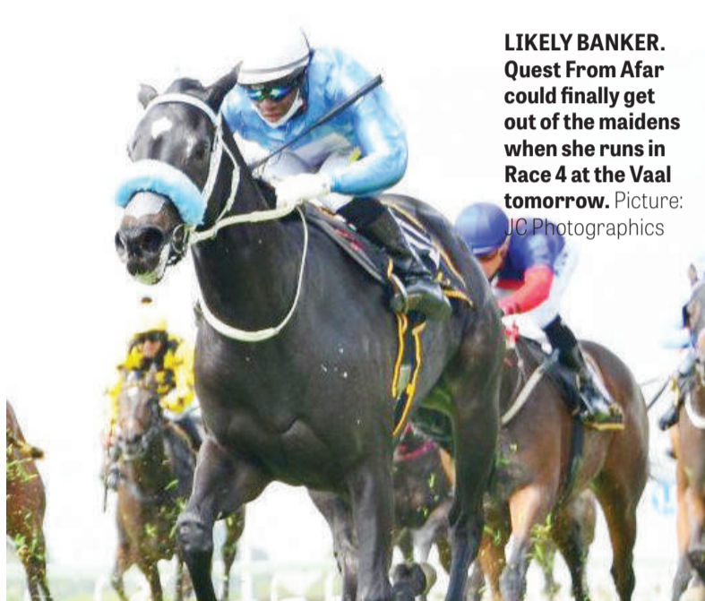
LIKELY BANKER. Quest From Afar could finally get out of the maidens when she runs in Race 4 at the Vaal tomorrow.