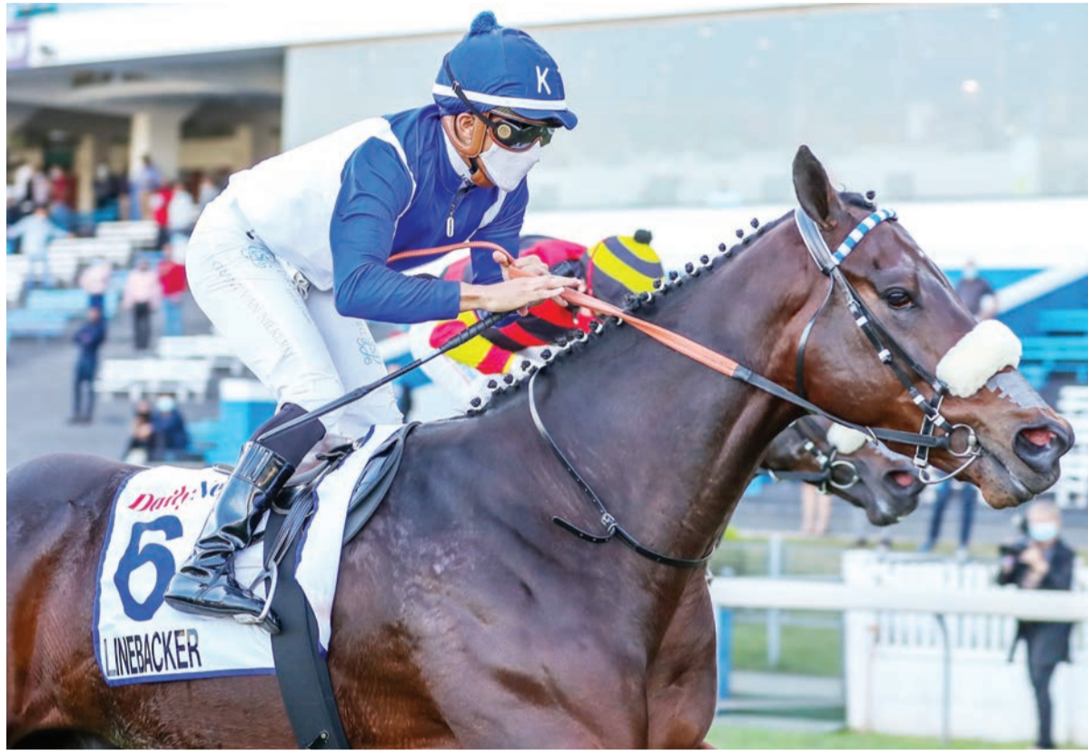
CO-FAVOURITE. Vaughan Marshall-trained Linebacker has joined Rainbow Bridge at the top of the betting boards for Saturday's R1.5 million L'Ormarins Queen's Plate over 1600m at Kenilworth.

L inebacker has joined Rainbow Bridge at the top of the boards for the Grade 1 L'Ormarins Queen's Plate.