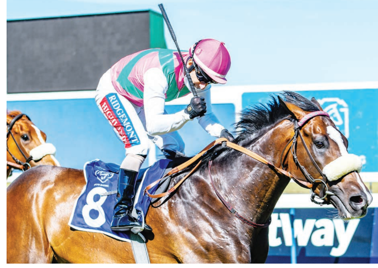
BIG FUTURE. Cape Guineas champion Double Superlative has been priced up joint second favourite at 5-1 to win the Grade 1 Cape Town Met, presented by World Sports Betting, over 2000m at Kenilworth on Saturday 29 January.

Linebacker disappointed in 1000m and the Majorca Stakes over 1600m.