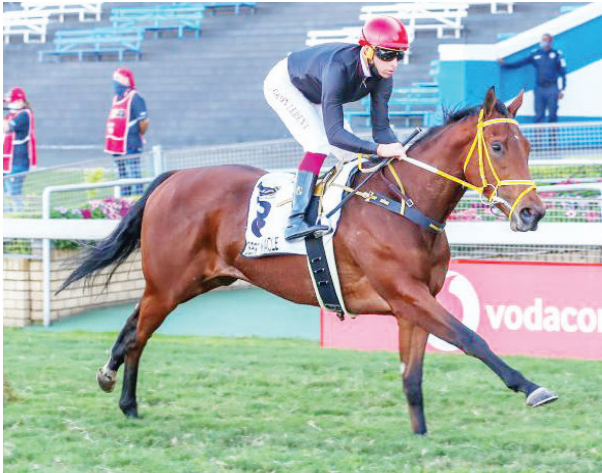
TOP FILLY. Desert Miracle is among the entries for the Grade 2 Wilgerbosdrift Gauteng Fillies Guineas over 1600m at Turffontein on Saturday 5 February.

Supplementary entries close at 9am on Monday 31 January with declarations by 1am on Tuesday 1