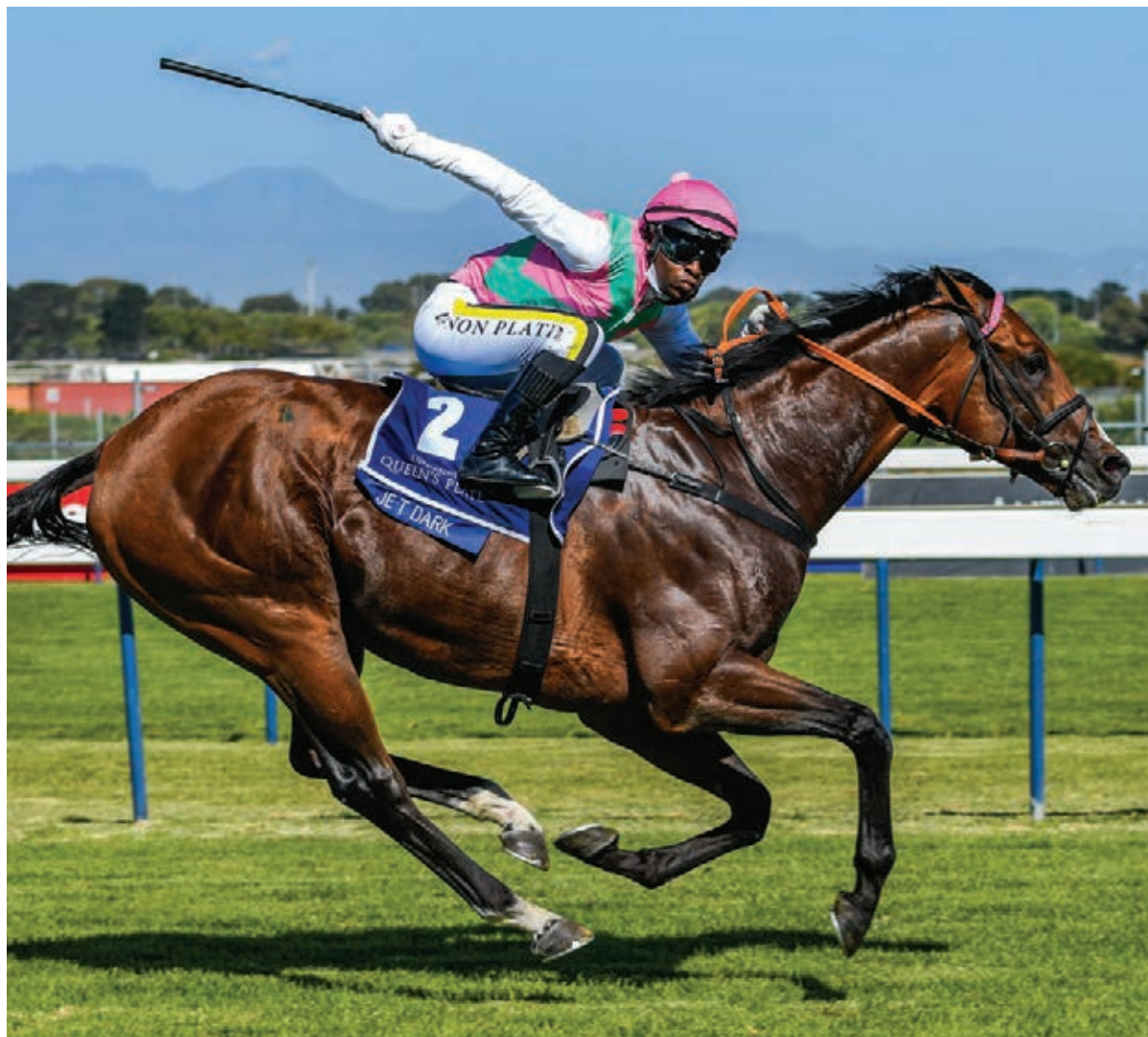
TOP PERFORMER. Jet Dark, winner of the L'Ormarins Queen's Plate, is Muzi Yeni's selection to win the R2-million WSB Cape Town Met over 2000m at Kenilworth today.

Kommetdieding has to be respected as the main danger and will be there again while three-year-old Cape Guineas winner