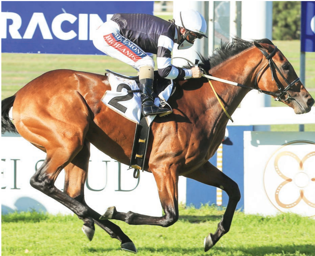
DISTANCE. Mask Vigilante looks best suited to 1200m and is expected to get back on the winning trail in Race 6 at Kenilworth today.

Australian-bred Whoa Whoa was confidently expected to win her last race over this course and distance but found